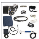
Education kits and transducers